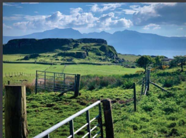
TIPS & TRICKS

"The best camera is the one with you" Chase Jarvis